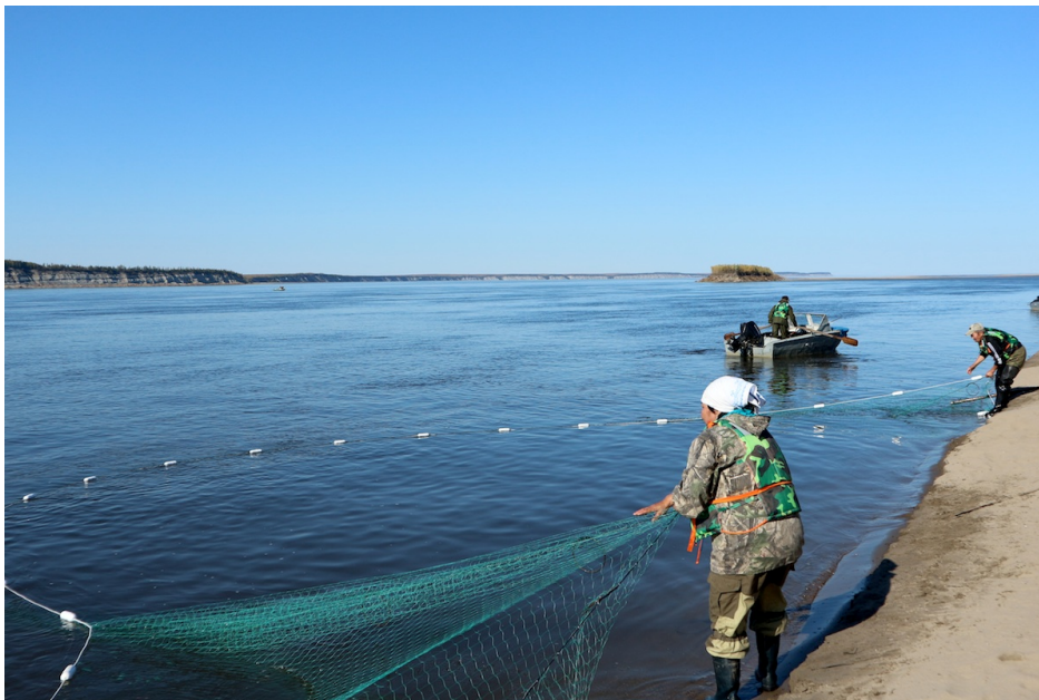
Seining on Lena.