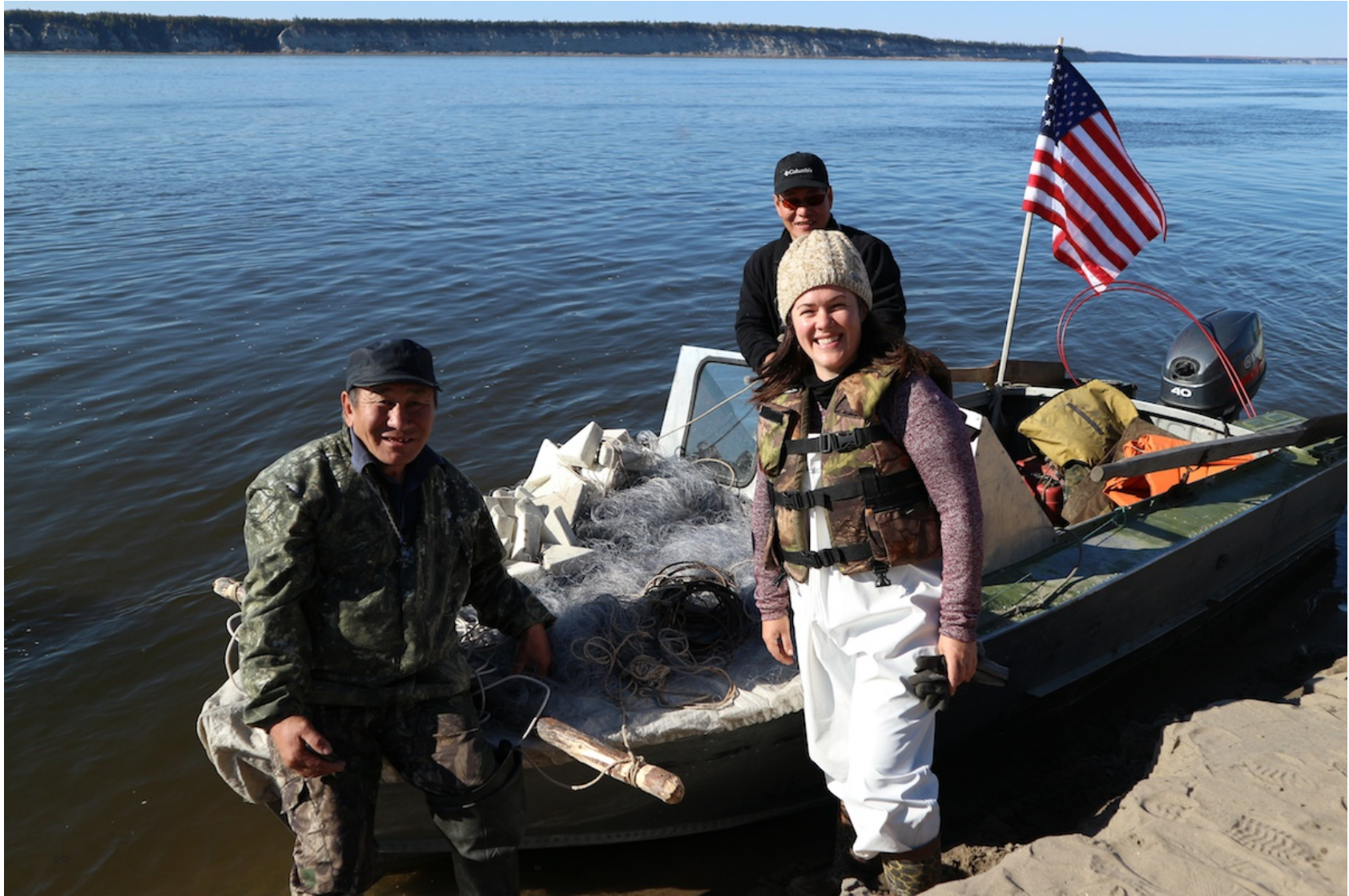
Evenk-Chukchi-US team "Amerika" during the seining event.