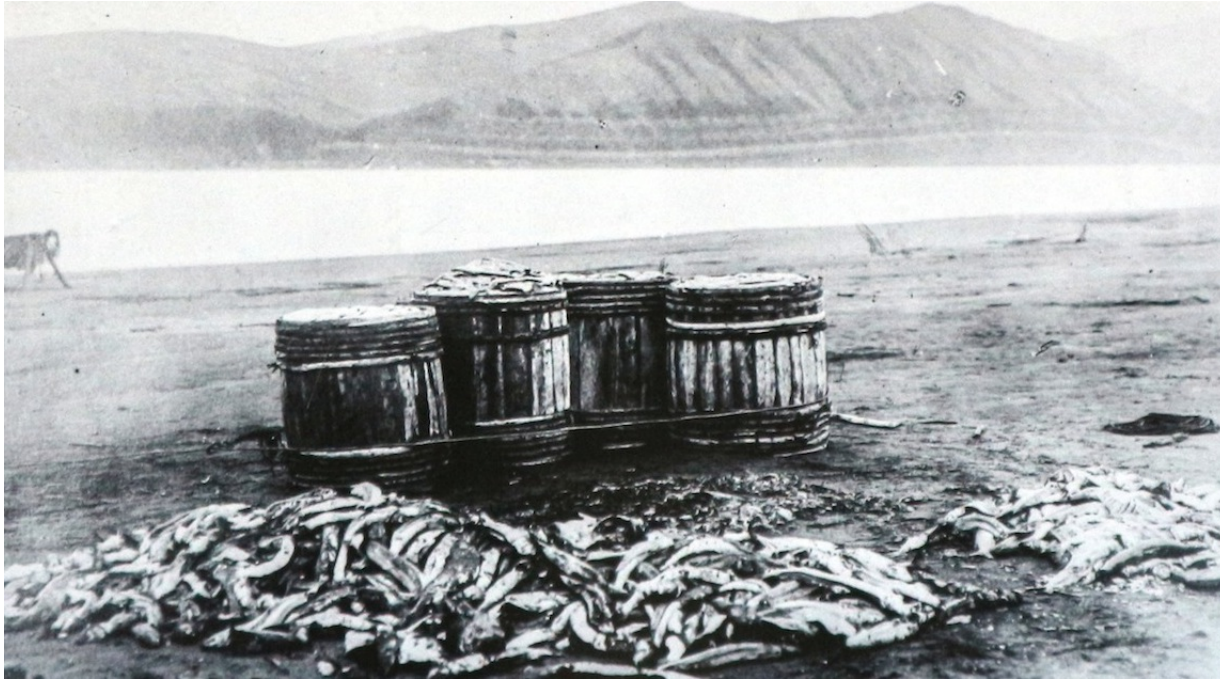
Catches of the Laptev Sea coastal fisheries in 1943.

The first Festival was held in Finland in 2014. For the 2016 Festival, Snowchange discussed with various partners the event which was decided to be held on the Lena river at the community of Zhigansk, Republic of Sakha-Yakutia, Siberia, Russia from 1 st to 5 th September, 2016. This photo essay and Snowchange Discussion Paper explores the event using photos.