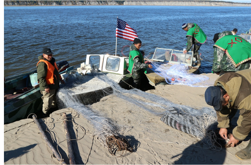
Nets are being loaded to the river boats.