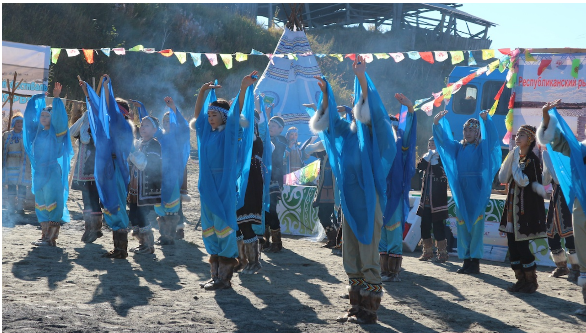
Blue symbolized the Lena River during the performances.