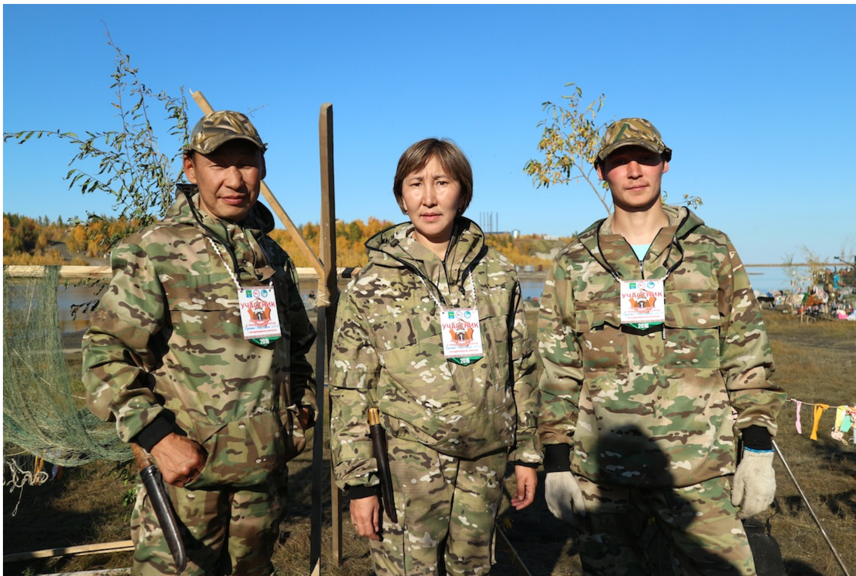
Fishing is the food security of Zhigansk, as these three professional fishers know.