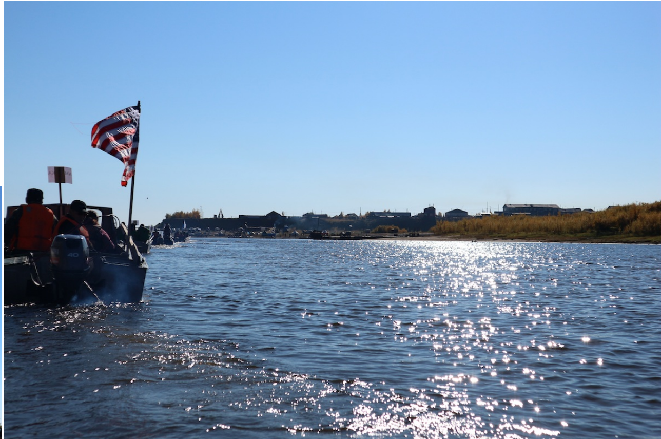
Arriving to Day 2 in a fleet of participants.