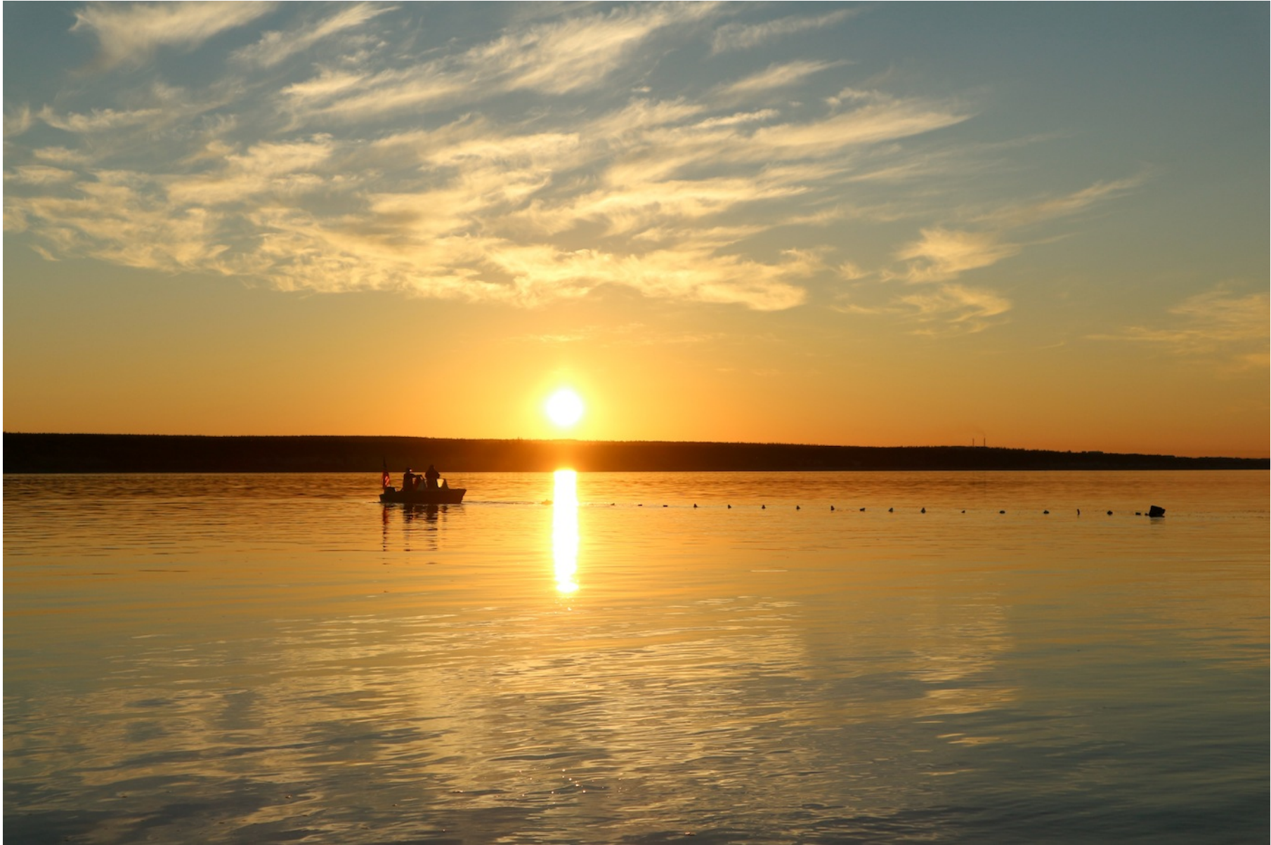
Day 1 concluded with the drift net harvest, resulting in omul whitefish for the winners.