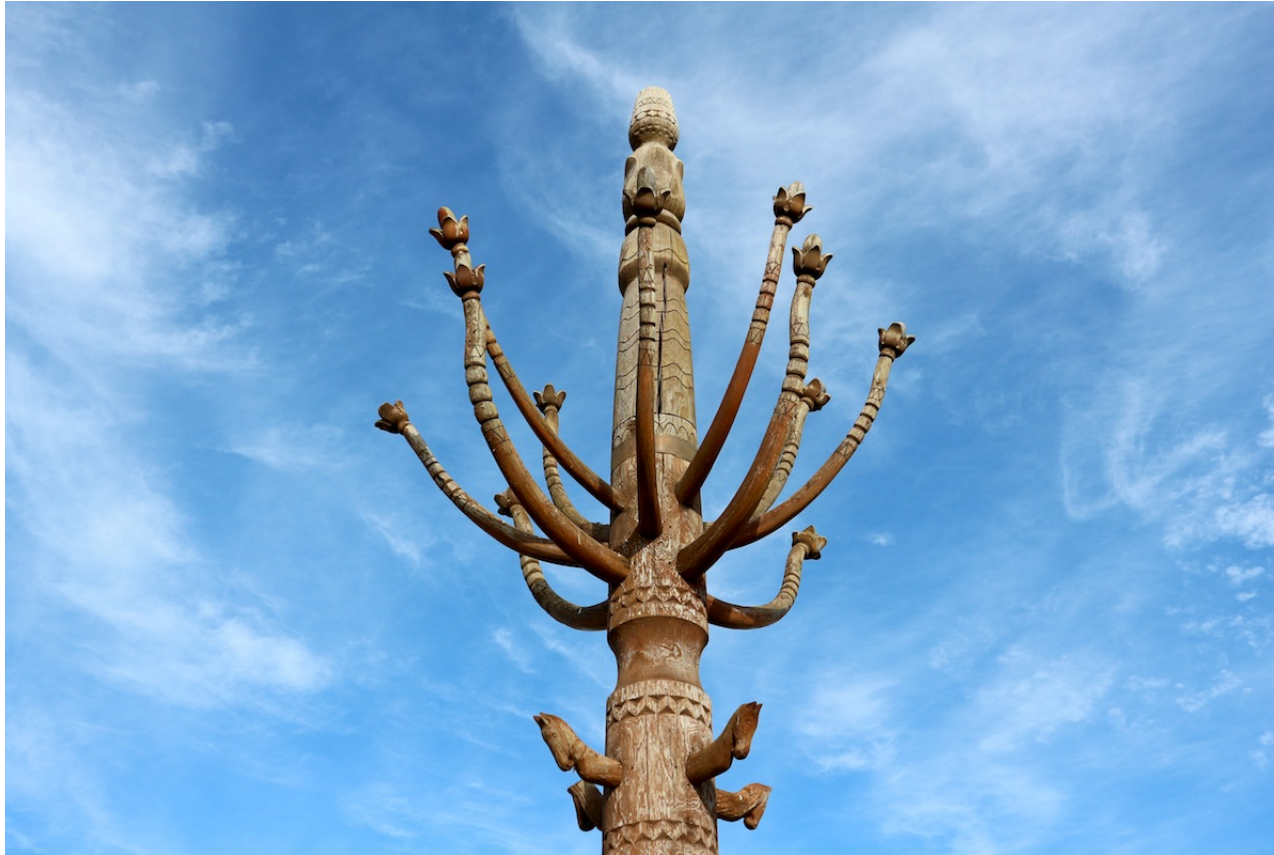
Participants had a possibility to admire the Sakha culture on a visit to the Ysyakh Festival Grounds in Yakutsk.