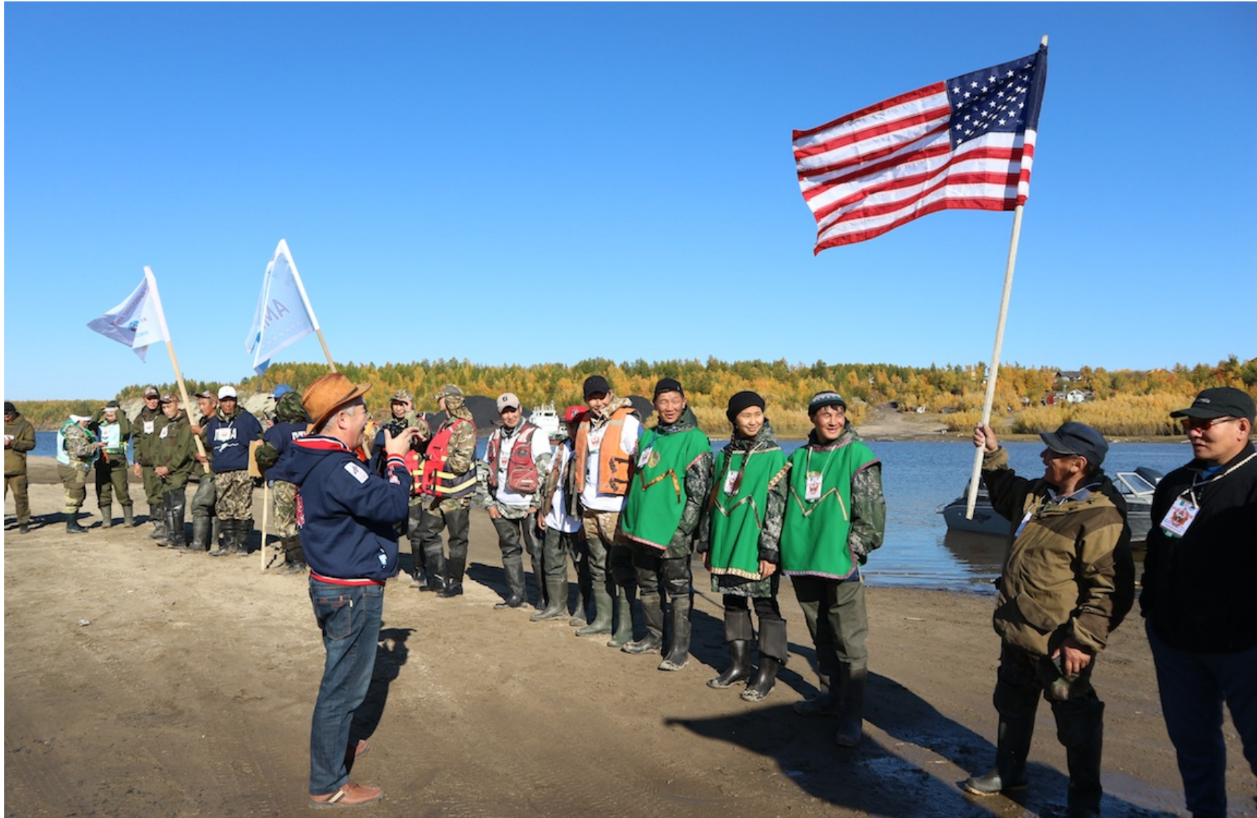
The Festival was opened with the flags of all teams flying high.