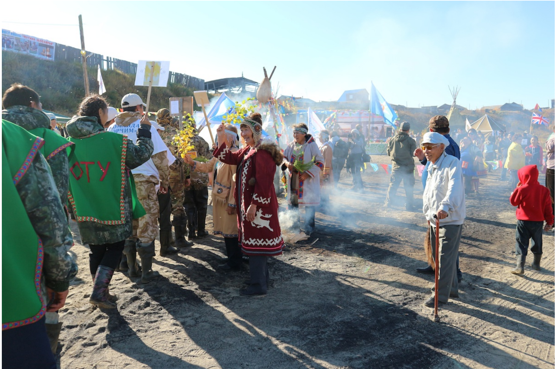
Opening of the Day 2.