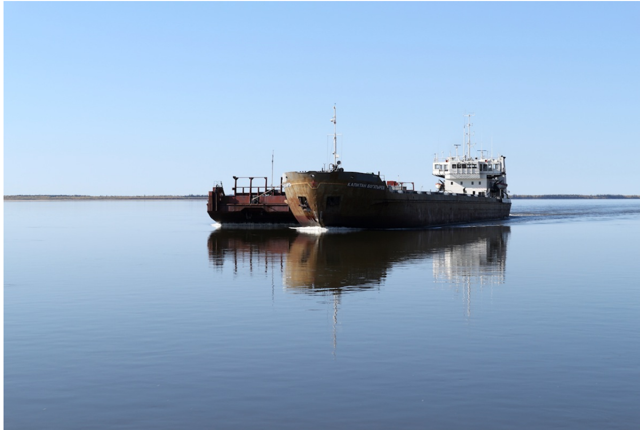
Cargo Ships on Lena.

We are thankful to all of these partners and co-organisers. The event was a great success. Over 60 delegates took part across Eastern Siberia, USA, the UK, Sámi, Finnish, and other fishing communities.