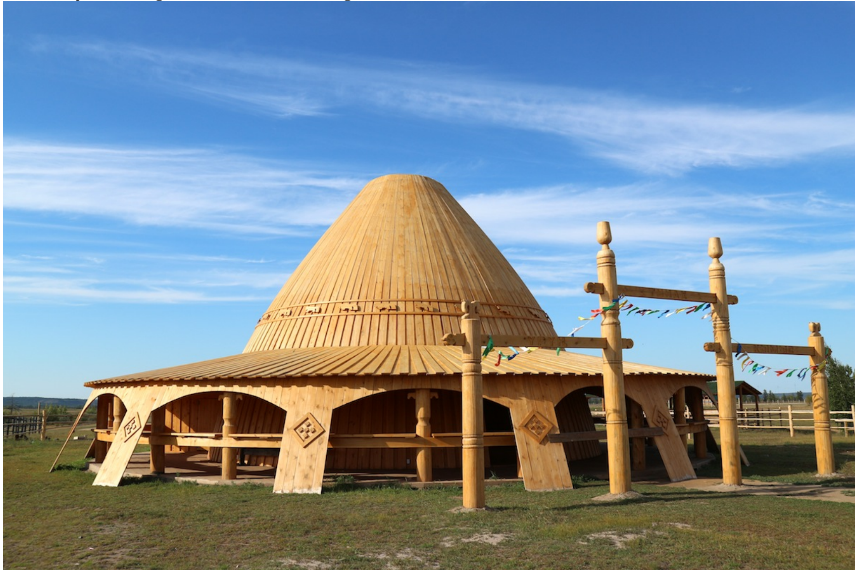
Ysyakh Festival Grounds in Yakutsk.