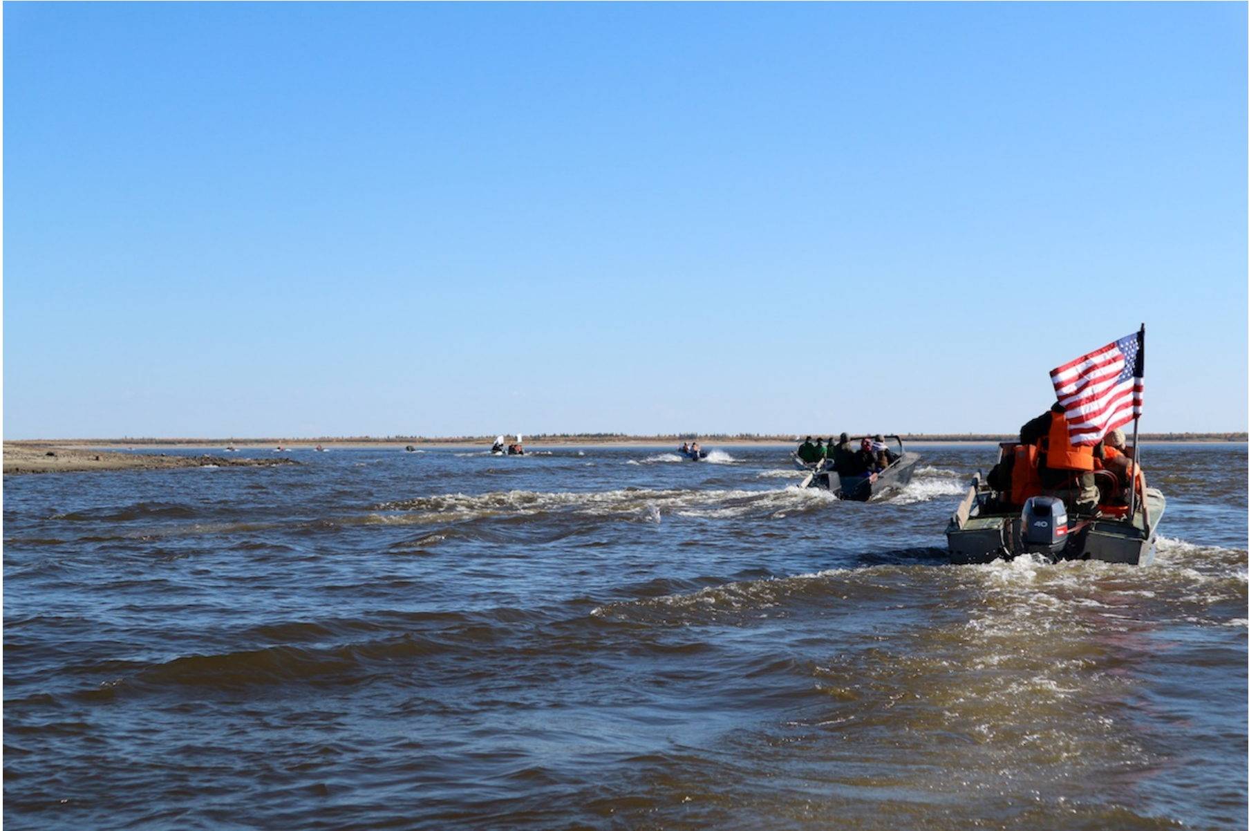
The first event was a seining competition on Lena, with all 14 teams, including 56 participants, crossing the river.