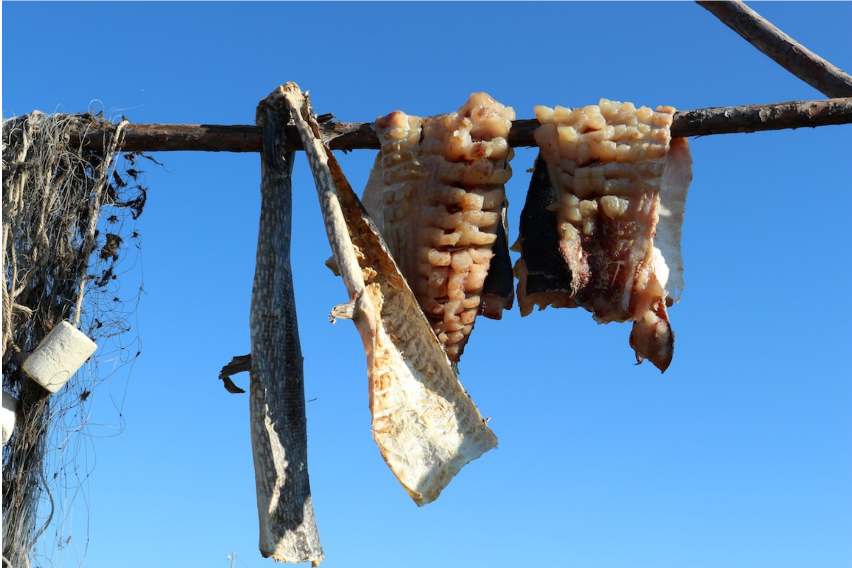
Northern pike, dried.