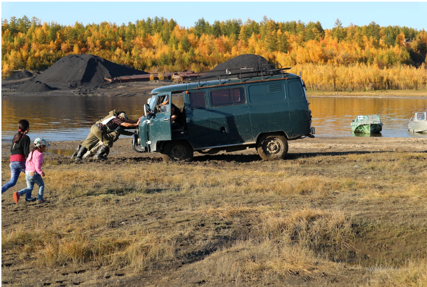
Some of the vehicles suffered from the wet conditions of the Festival ground.