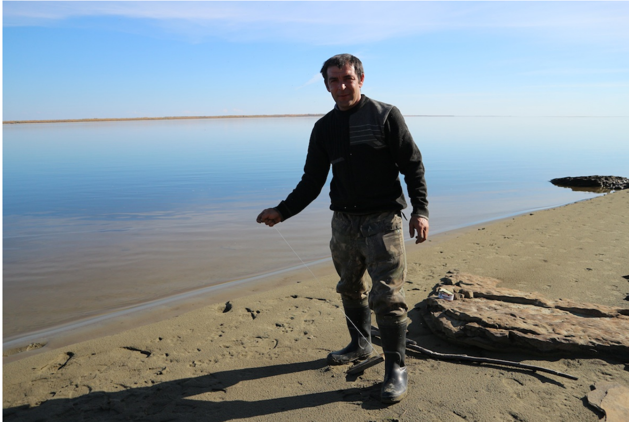
Traditional line fishing on Lena for sturgeon.