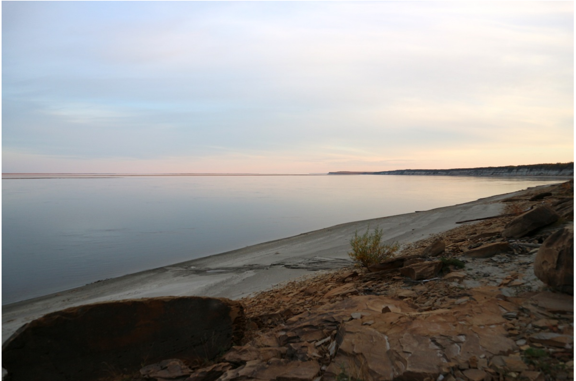
Lena River, the sacred provider of the Sakha-Yakutia.