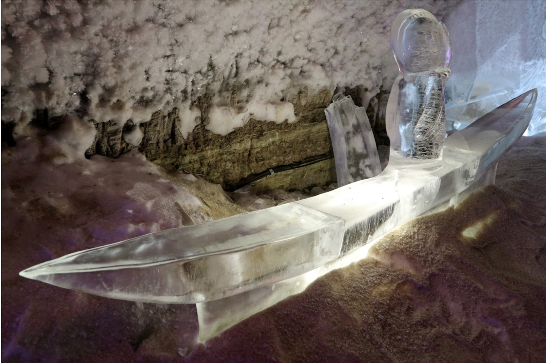
Fisherman on a boat depicted in an ice sculpture in Yakutsk permafrost kingdom.