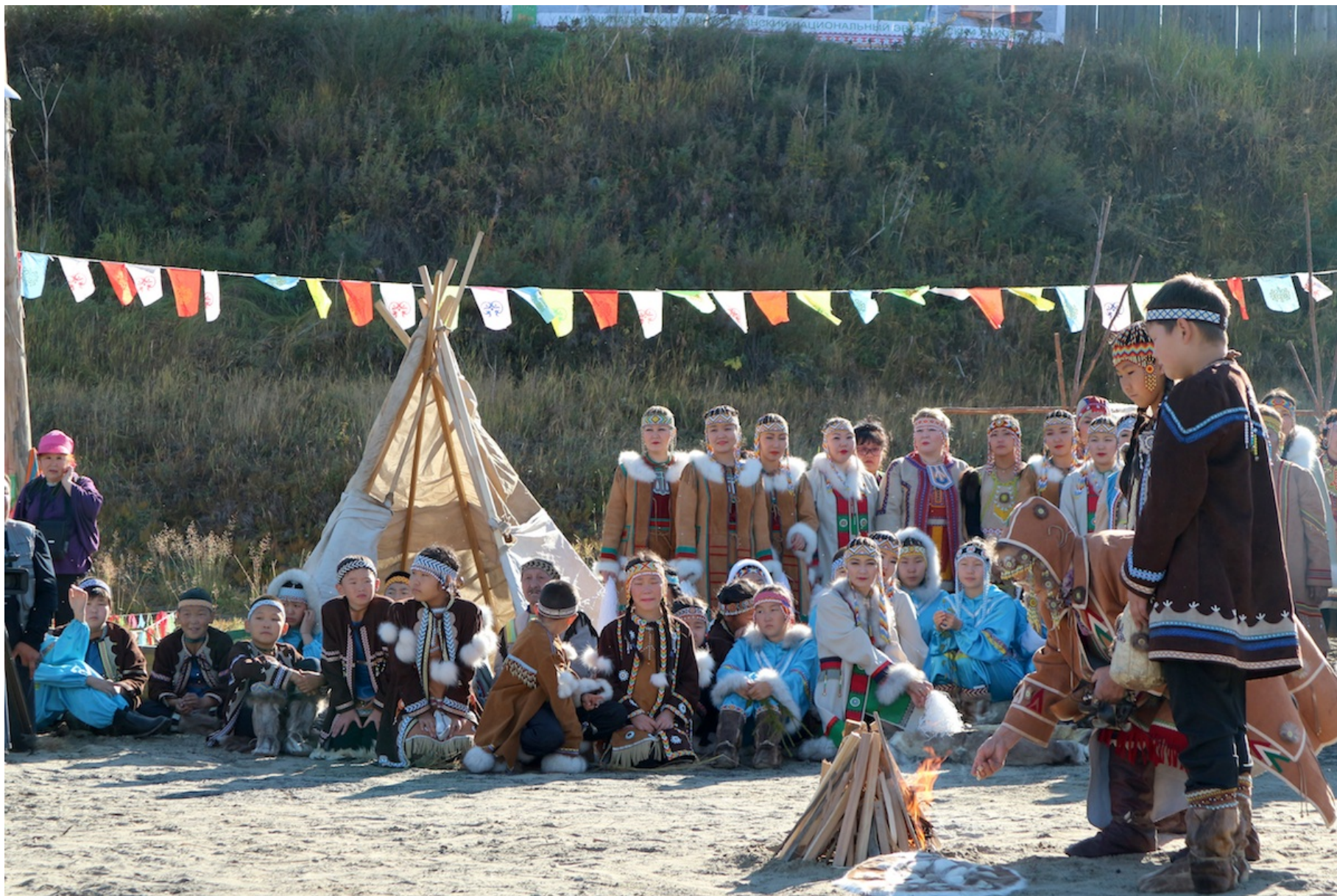
Evenk Elder lighted the sacred fire for the Day 2.