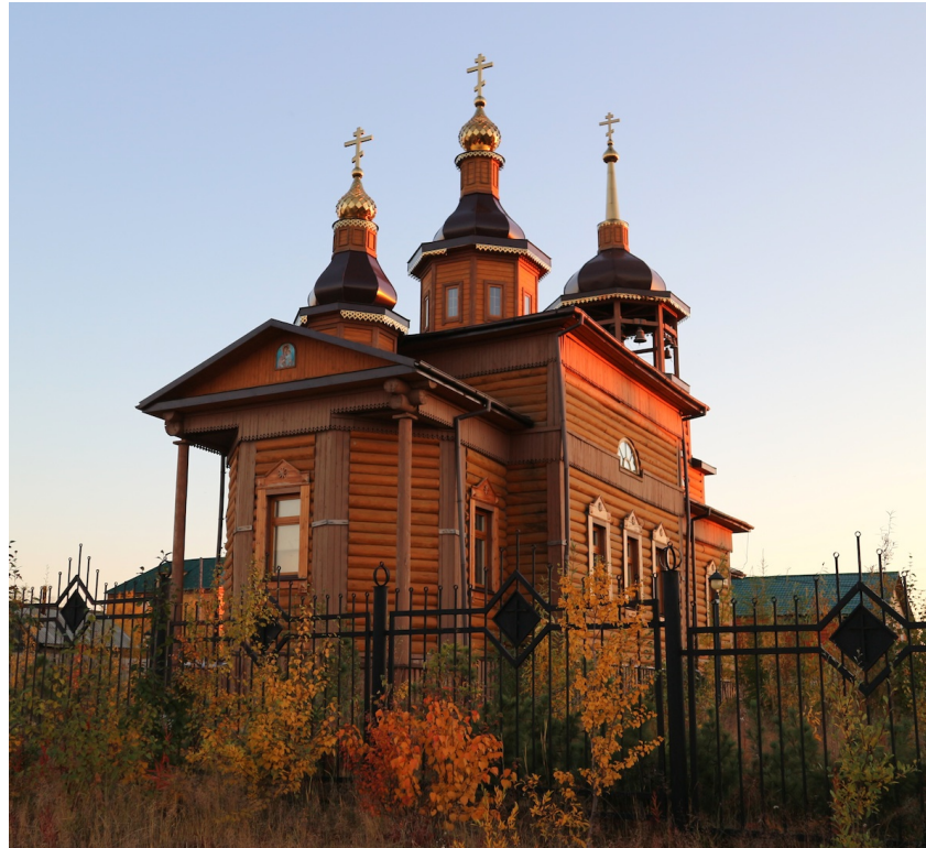
Church of Zhigansk